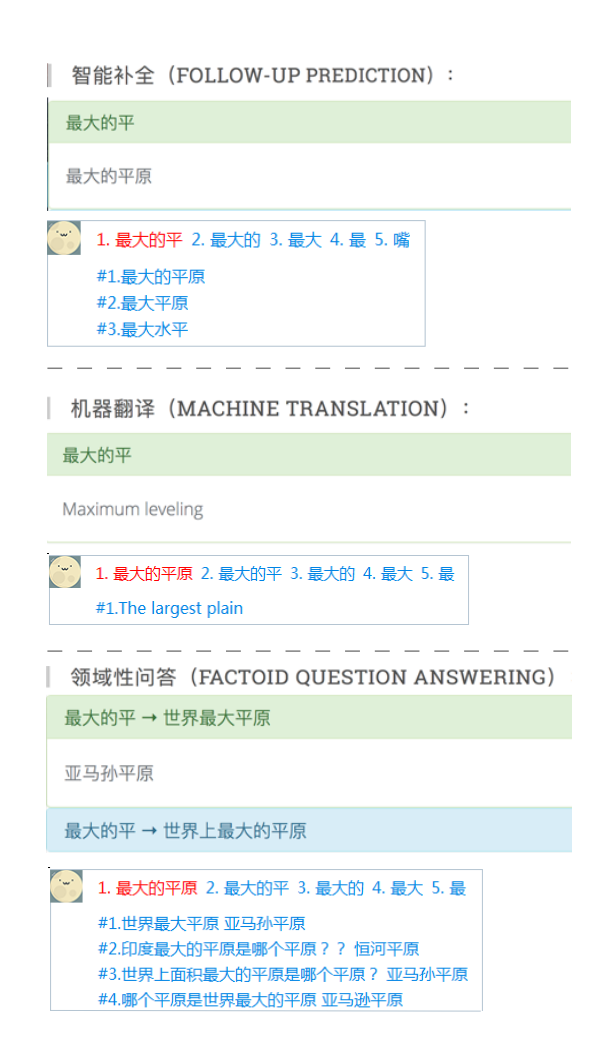
Figure 2: A case study of Association Cloud Platform.

Factoid Question Answering As an instance of IR-based association module, we make use of question answering (QA) corpus for automatic question completion. Intuitively, if a user wants to raise a question, our IME will retrieve the most matched question in the corpus along with the corresponding answer for typing reference. We use the WebQA dataset (Li et al., 2016) as our QA corpus, which contains more than 42K factoid question-answer pairs. For example, if a user input "吉他有" or "吉他弦" (guitar strings), the candidate "吉他有几根弦" (How many strings are there in the guitar?).